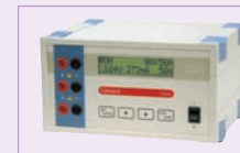
for Power Supplies and Product Selector see page 24/25

A maximum of 100 samples per gel can be resolved making this unit ideal for those routinely checking medium numbers of samples over short to medium gel run lengths.