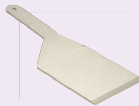
Scoops for safe transfer of gels

With gel tray options of 10 x 7cm and 10 x 10cm, the multiSUB Midi has been designed for routine horizontal gel electrophoresis. Extending only the width of this unit allows more samples to be resolved per gel than the multiSUB Mini without a significant increase in buffer or gel volumes.